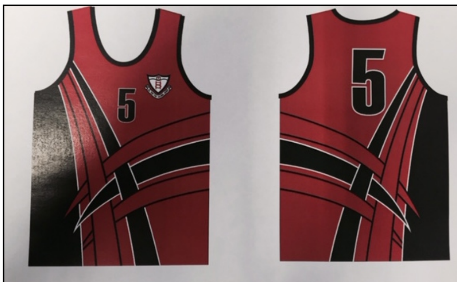
New design for Sacred Heart Representative Team sports

Tuesday and Wednesday of this week our Gr 3-6 students who have registered interest to play in Primary School Basketball tournament had tryouts for teams. Parents would have received the letter previously about this and the principles and guidelines the school will support in the selection of teams and their participation during the tournament.