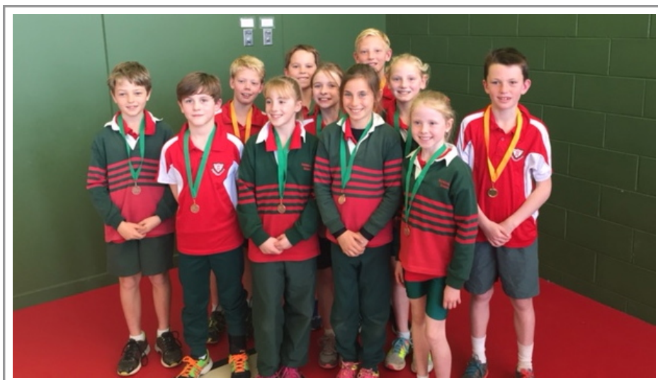
Last weeks assembly, medals were presented to the Gr 3 Girls, Gr 3 Boys, Gr 4 Girls and Gr 5 boys teams event from the All Schools Cross Country

The Defibrillator purchased by the P & F has arrived. We are in the process of registering and organising with St. John Ambulance training for up to 10 staff. We are choosing staff who are not on a class e.g. office staff, leadership staff and some ancillary staff.