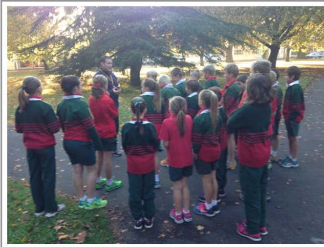
Cross Country training at the Brickfields

The reality is having the shirts untucked when wearing trousers, shorts and a tie in appearance does not reflect the expectations we have of wearing the uniform with pride and the community at large seeing this.