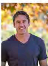
Anthony Koutoufides 278 games, 226 goals

Our football camp programs are overseen by experienced coaching panels with guest appearances from former Carlton FC AFL superstar Anthony Koutoufides. The two day innovative program covers all facets of football designed to improve skills in an enjoyable environment. Participant groups are assigned a coach who provides written feedback after taking them through the program. Each participant receives an autographed photograph with the coaching director.