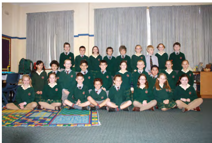
Gr 4 Underlin