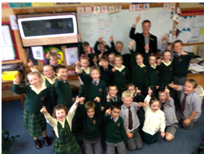
Gr 2 van Ryn

Congratulations also to Gr 2 van Ryn - 1st place, Gr 5 McLeod/Viney - 3rd place and Gr 3 Symons - Highly Commended