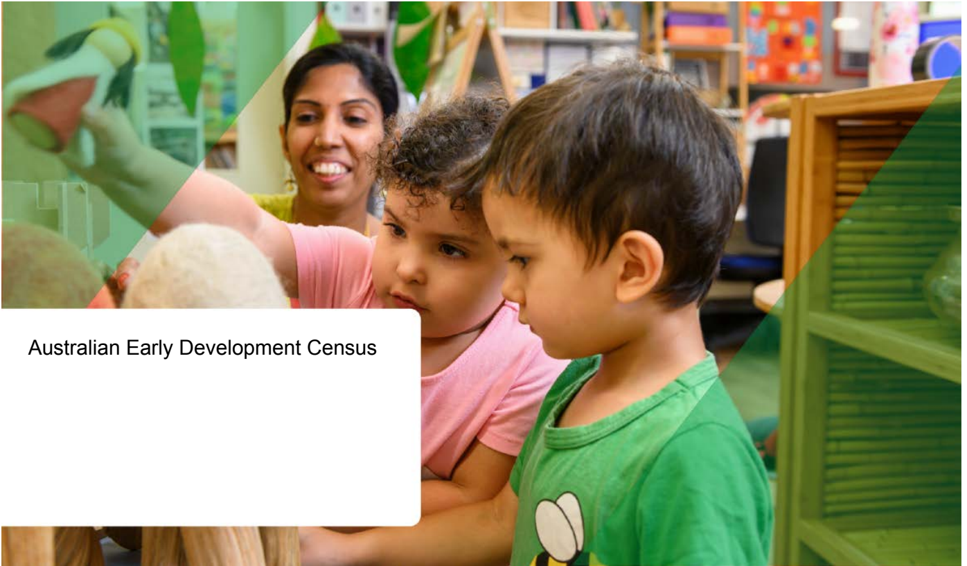
Australian Early Development Census