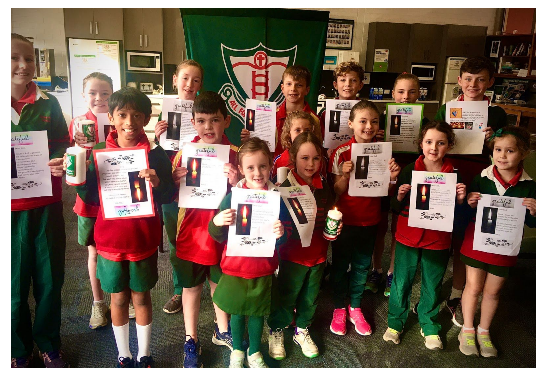
Our Class Representatives sharing their Grateful Prayers.