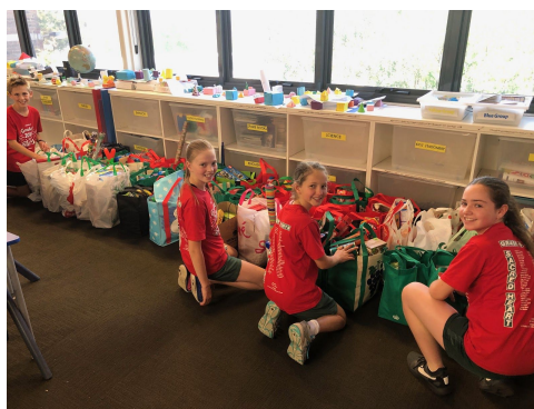
The Mini Vinnies Team

Thank you to everyone who has thought of people in need this Christmas.