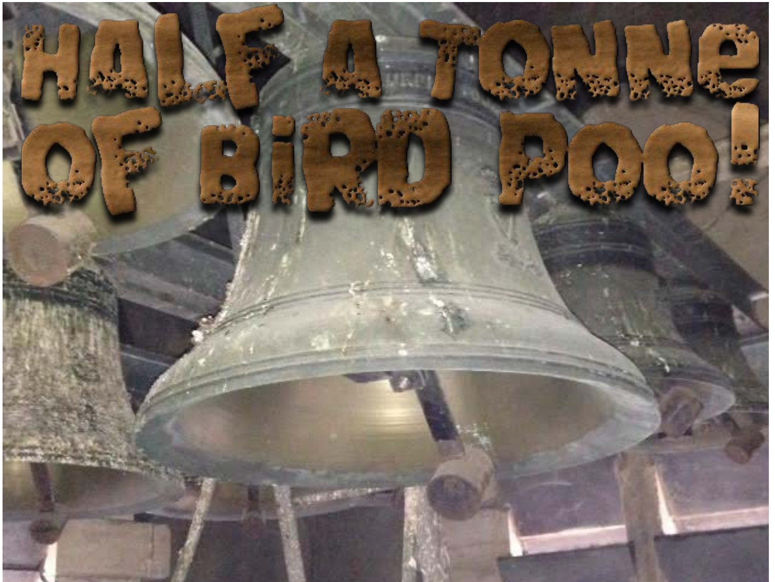
600kg were removed from the Church of the Apostles' bells this week. That's a lot of poo!