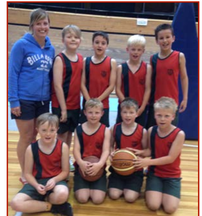
3/4 Boys B - Cowley