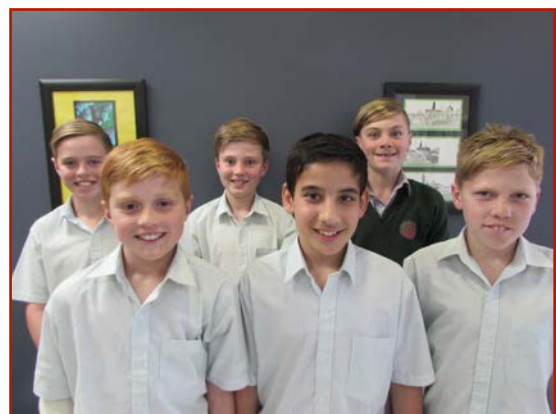
5/6 Boys A - Davie