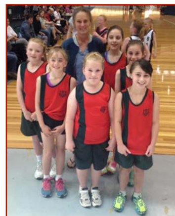
3/4 Girls B - Illingworth