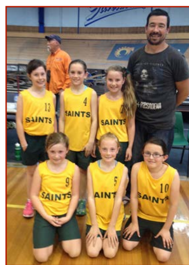
3/4 Girls B - Warren