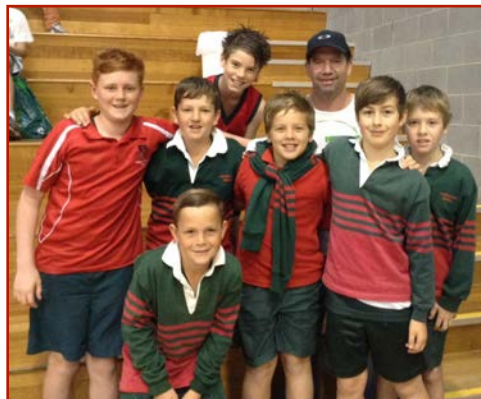
5/6 Boys B - Adams