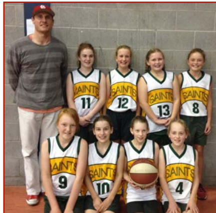
3/4 Girls A - Baldock