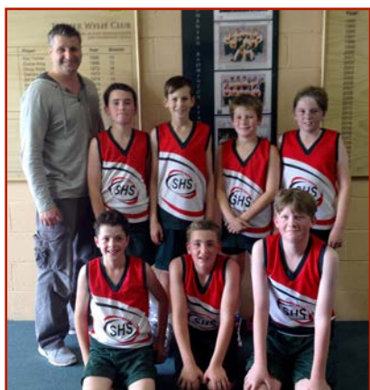
5/6 Boys B - Boric