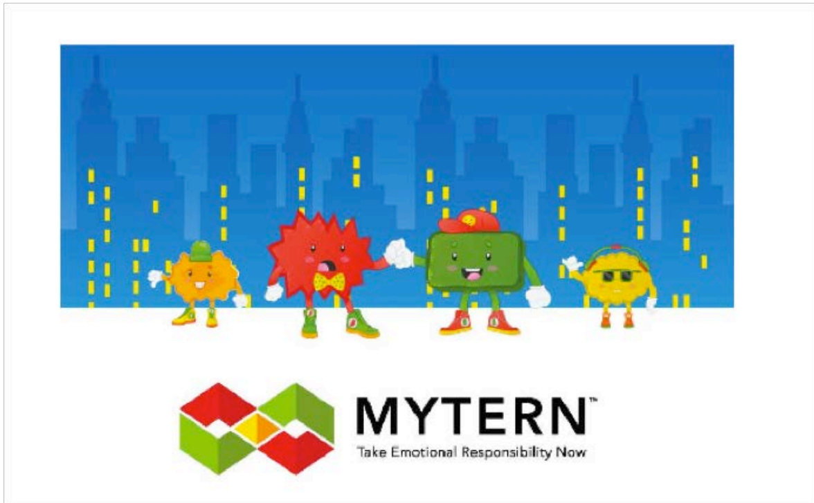
Post 2 of MYTERN (Take Emotional Responsibility Now)