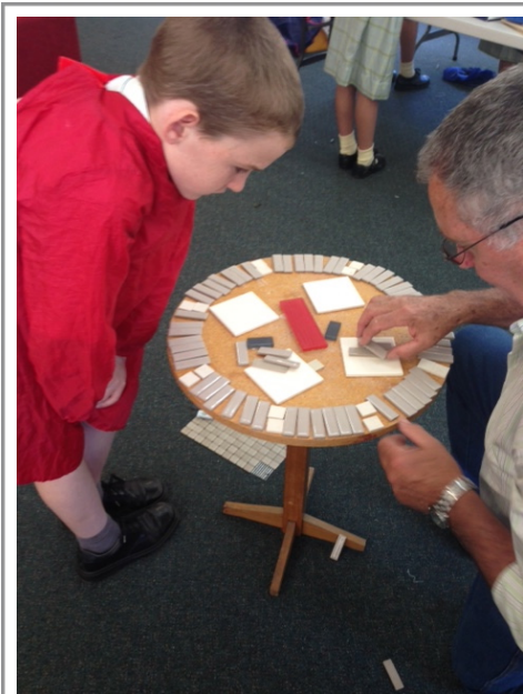
Grade 4 working on their Mosaics

The education and care of our students is a partnership between the staff and parents and we all need to do our bit by acting appropriately and not showing a disregard for road laws, even if only to demonstrate your support to children watching of appropriate behaviour.