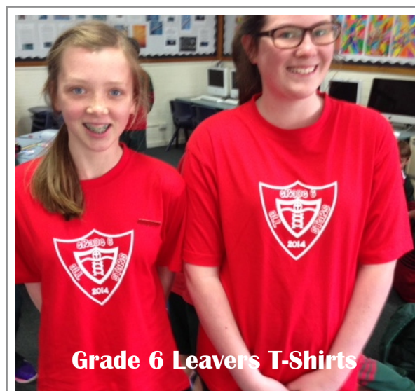
Grade 6 Leavers T-Shirts