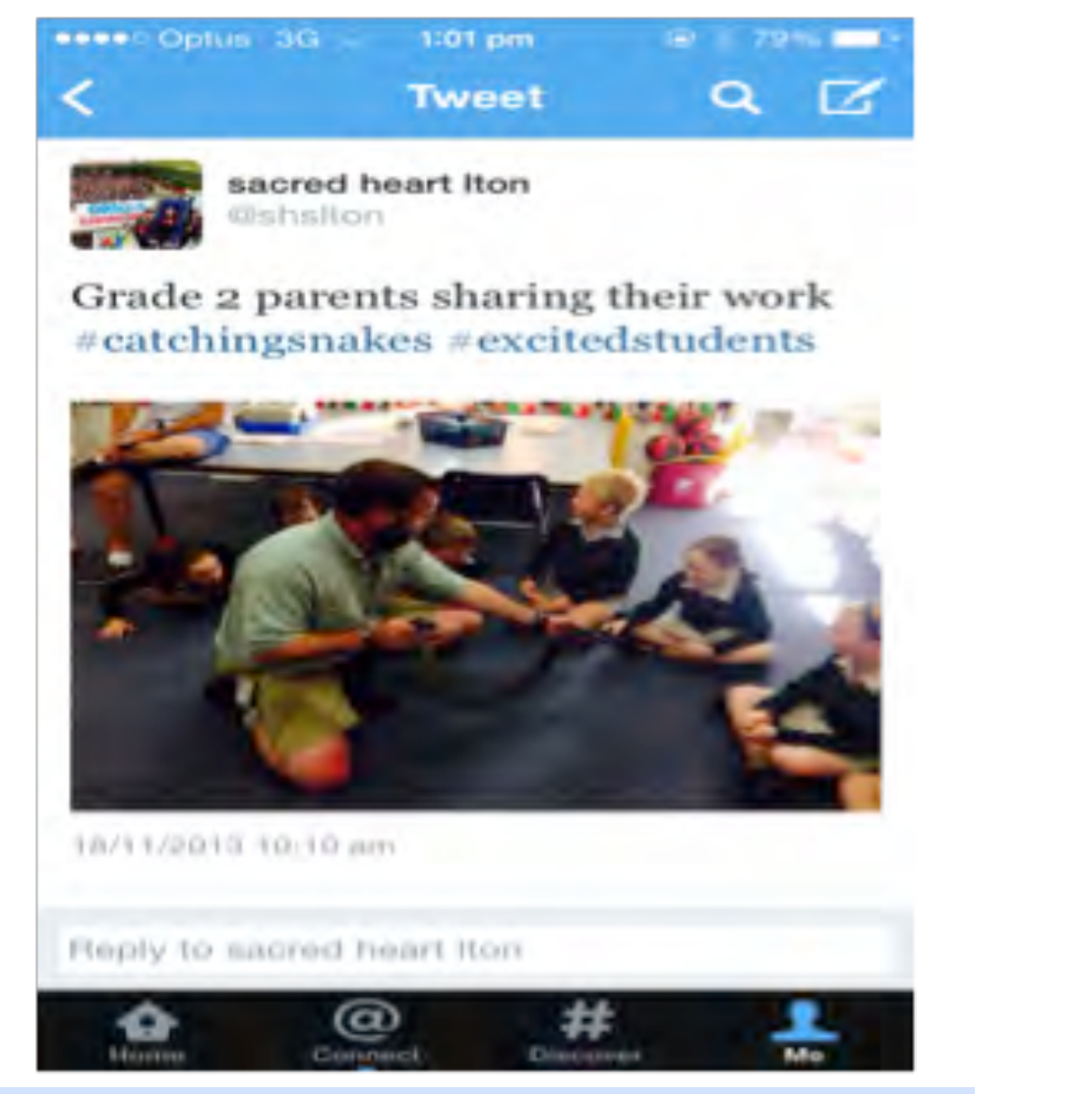
Twitter opportunities to see what is happening in our classrooms as above. Sign up through our Twitter feed.