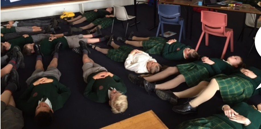
Meditation with Grade 5 as part of our day